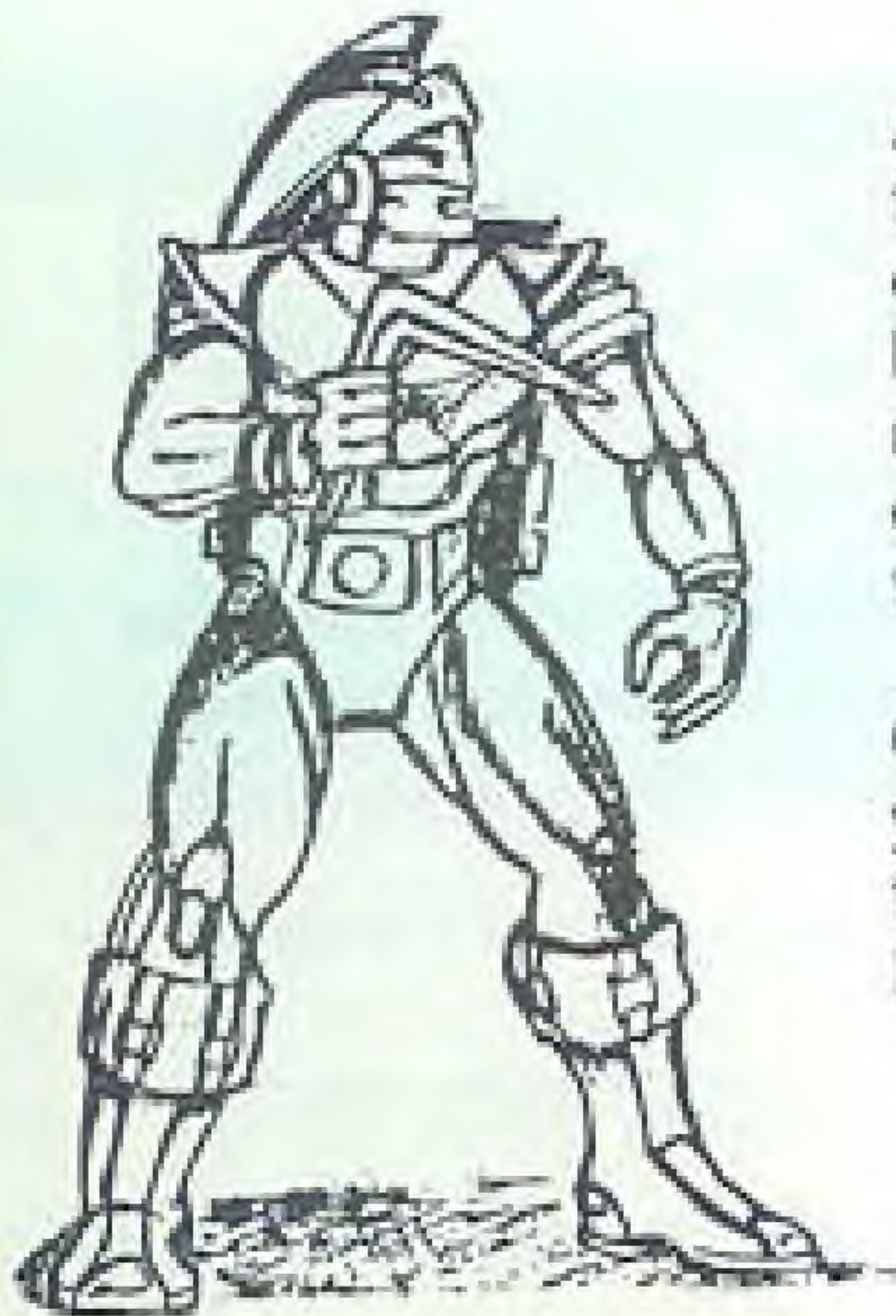
A MOST GREAT WARRIOR

A Most Great Warrior: This nameless hero has taken on the task of destroying the demon Kull and freeing the condemned souls. He is equipped with booster rockets on his back and can leap great distances. Some times he must rely on his booster rockets, sometimes he must rely on his quick reactions and jumping ability. Always he can throw his magical boomerang.